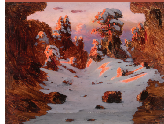
Arkhip Kuindzhi, Sunset Effect , 1900-1910, oil and paper on canvas, State Russian Museum, St. Petersburg

The Barge Haulers on the Volga is one of the most important works in the history of art. It has also been called 'Russia's Night Watch'. The painting is imposing, both for its size (131.5 x 280 cm) and its epic realism. Thanks to the many reproductions of this work in public buildings, almost every Russian knows it. Eight more paintings by Repin can be admired in the Peredvizhniki exhibition.