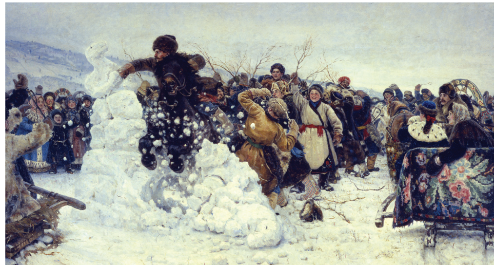
Vasily Surikov, The Storming of a Snow Fortress (1891), oil on canvas, State Russian Museum, St. Petersburg