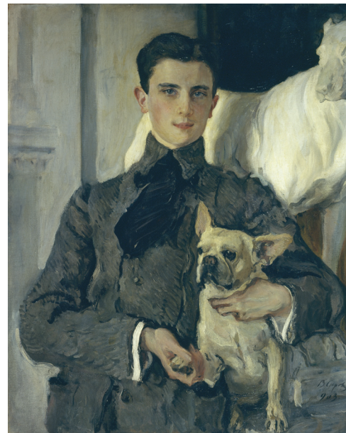
Valentin Serov, Portrait of Count Felix Sumarokov-Elston (1887-1897), later Prince Yussupov, 1903, oil on canvas, State Russian Museum, St. Petersburg

The Peredvizhniki foregrounded a new theme in their work. They addressed pressing issues such as primitive living conditions, social injustice, and famine. Their socially critical paintings were controversial and served as a weapon in the debate on social reform. The art of the Peredvizhniki was also known as 'the art for all Russians'. Their portraits of common people, the elite, friends, and family depicted reality. Harsh daily life in all its facets was elevated to art with a bright, fresh palette. They also depicted nature, landscapes, folktales, and episodes from Russian history.